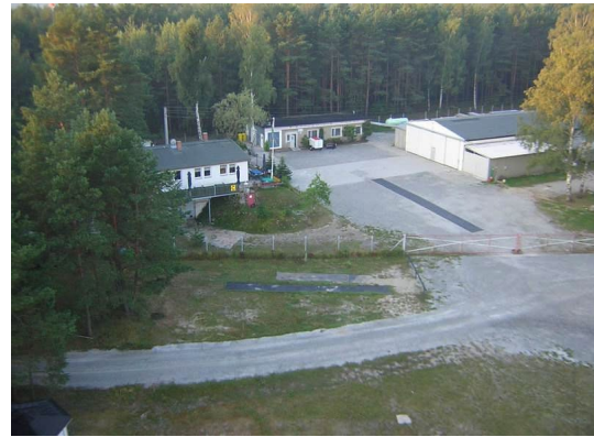
Clubhouse, hangars and sanitary facilities