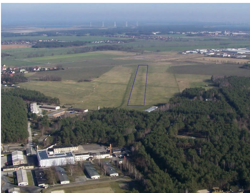
View of the airfield from western direction