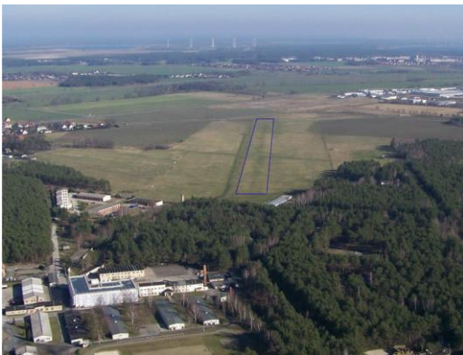
View of the airfield from western direction